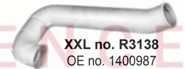
XXL no. R3138 OE no. 1400987