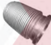
XXL no. R0331 OE no. 1387983