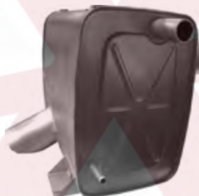
XXL no. J9322 OE no. 9424902801 For V8 ADR Version