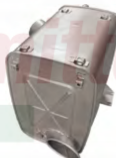
XXL no. K0024 OE no. 9424901501 For construction site