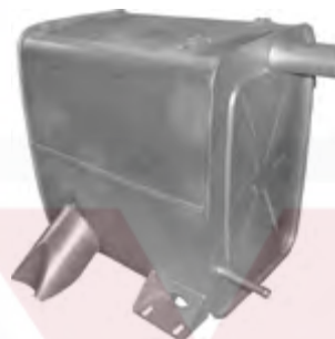
XXL no. J9312 OE no. 9424902701 For Road version